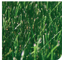
POA Annua (Annual Bluegrass)