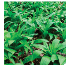
Wild Onion & Wild Garlic