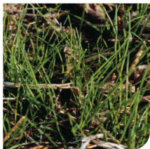
POA Trivalis (Roughstalk Bluegrass)